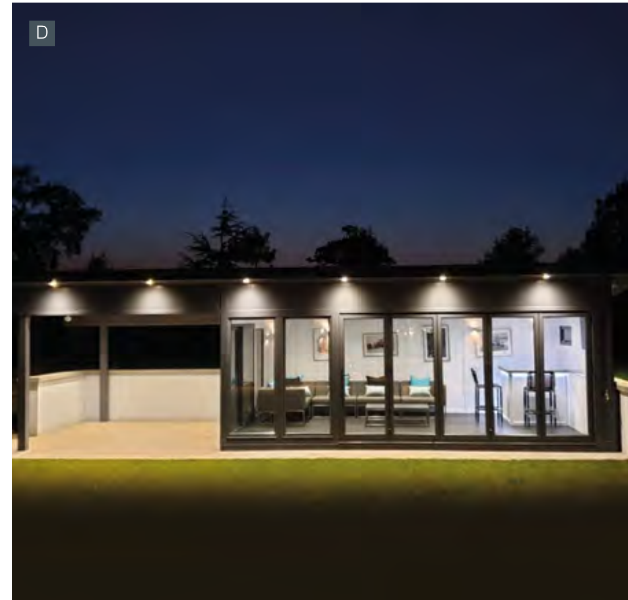
A Bi-fold 8.5x3.75m (inc 2.8m store) Finished in RAL 7016 Anthracite Grey.