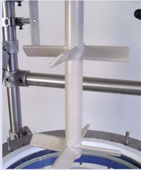
Various stirrer shapes and materials