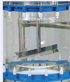
Height adjustable stirrer for optimal loosening, pressing and flattening of filter cake