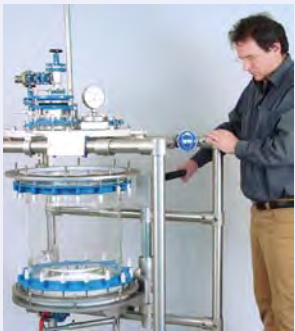
2-step lowering device