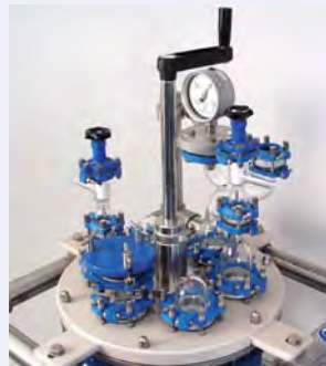
Cover plate with accessories