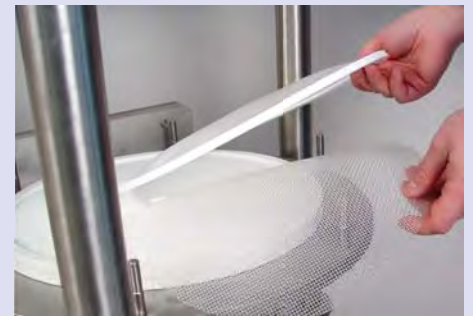
Filter plate with lowering device for easy filter change