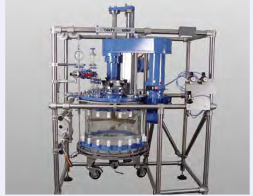
160 Litre Pneumatic lifting / lowering of stirrer, ATEX