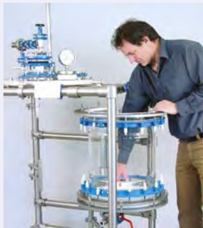
Swing-out mechanism for removal of filter cake