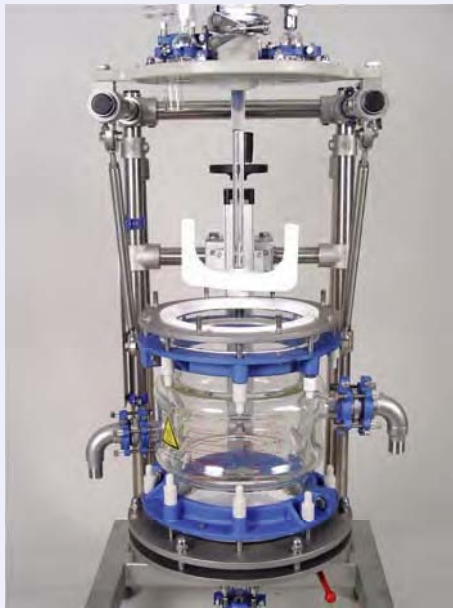
5l miniSolidphase reactor / filter, with heating jacket and anchor stirrer in glass / PTFE