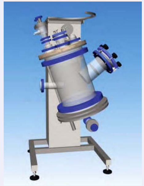
High containment filter with glove nozzle, for inert conditions in cGMP facilities