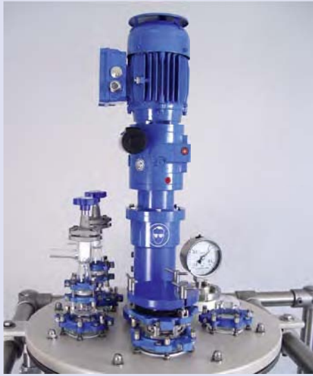
Motor agitator (ATEX)