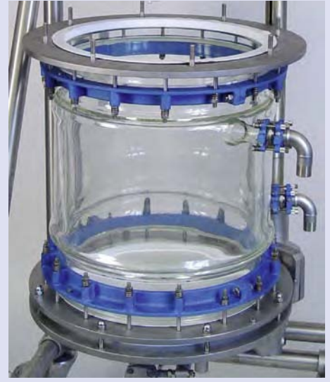
Heating / Cooling jacket