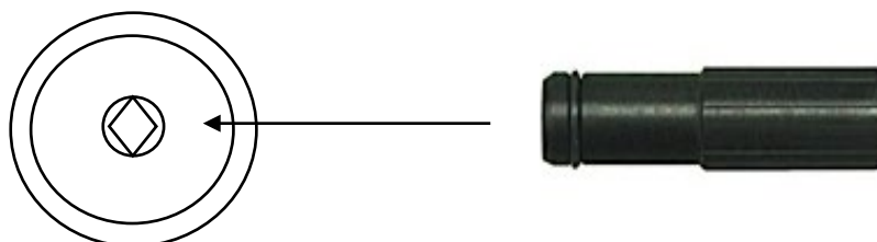
E-fitting (base of handpiece)

Use the E-fitting nozzle with your aerosol oil to lubricate in this hole.