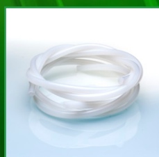
6 mm Nylon Tube