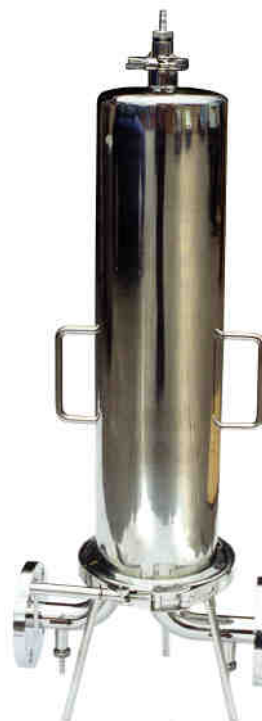
LC 3X500 SS HYGIENIC