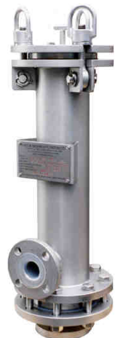
LC 1X250 SS FEP LINED