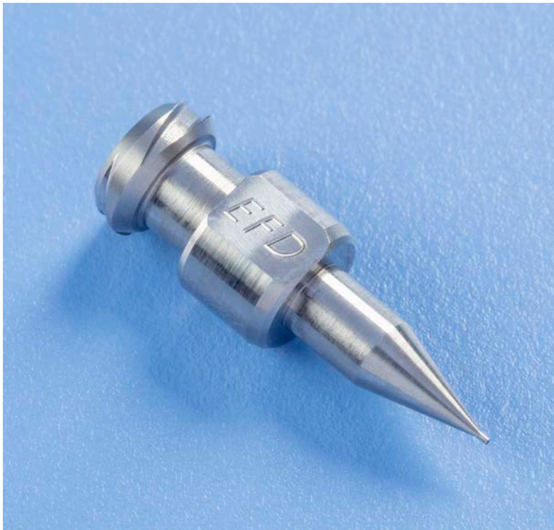
Optimum SmoothFlow stainless steel precision nozzles offer orifice sizes from 100 to 500 \mu\text{m} .

Micro-dispensing for high-precision applications