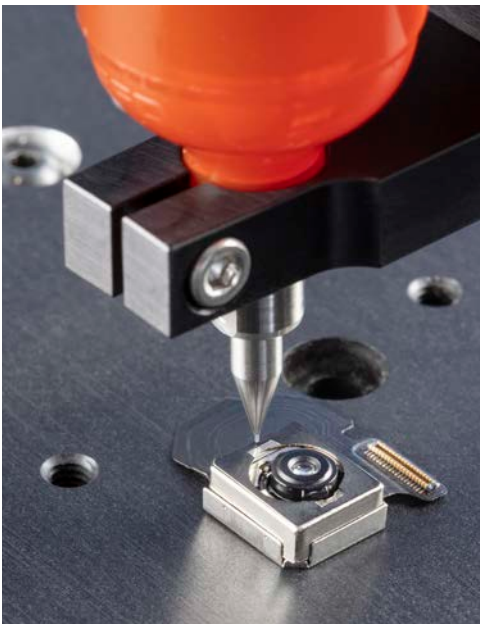
Micro-deposit dispensing onto a compact camera module.

Precision nozzles can be used without a retaining nut on 725D/DA, 741V, and 752V valves, or on a syringe.