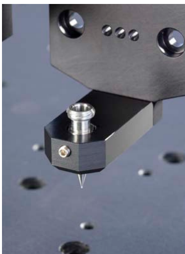
Nozzle-stabilizing fixture holds nozzle in a secured position.