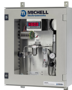
Hygrometer Sampling System

Michell offers a broad range of sensors with associated display and sampling systems for dew-point measurement applications, from trace moisture measurements to all compressed air quality class ranges – meeting the needs of a broad range of applications.