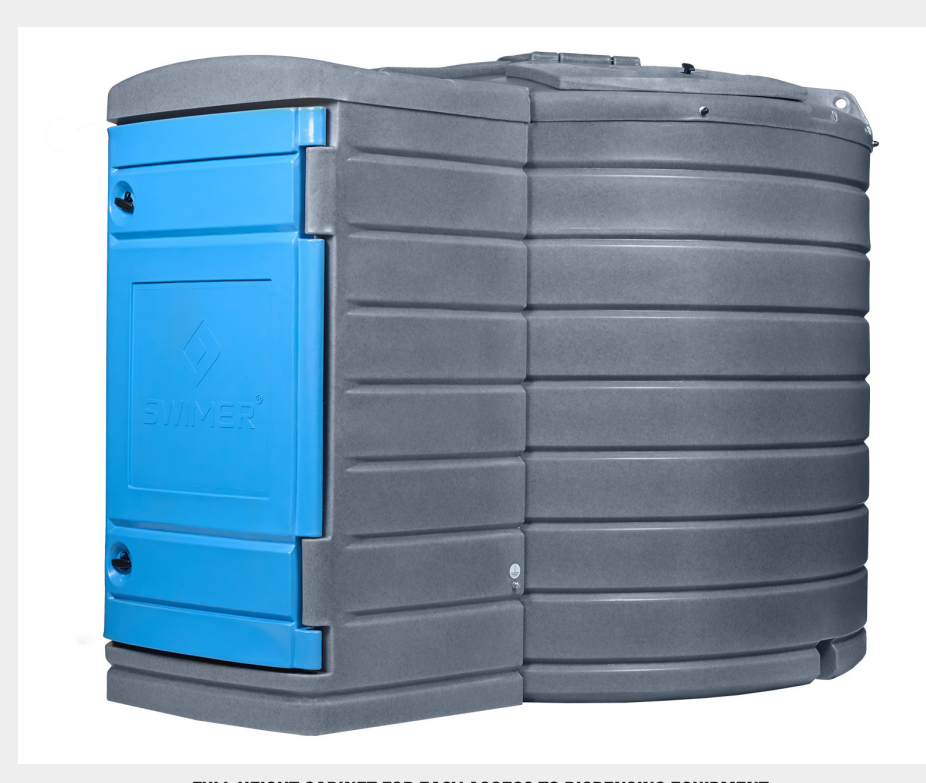
FULL HEIGHT CABINET FOR EASY ACCESS TO DISPENSING EQUIPMENT