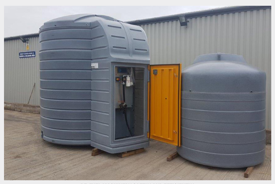
RE-FUEL MACHINERY SAFELY AND EFFICIENTLY