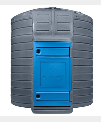
FRONT VIEW OF 10.000 LITRE TANK