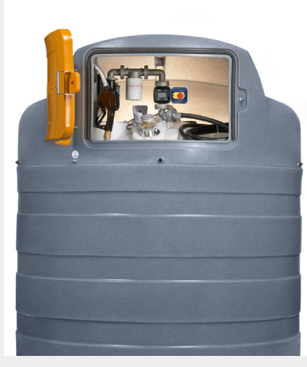
2.500 LITRE DIESEL TANK DISPENSING CABINET