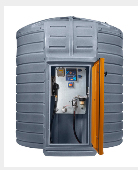
10.000 LITRE DIESEL TANK WITH LOCKABLE CABINET