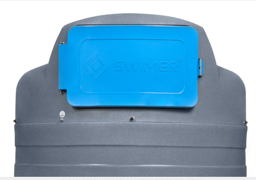
DURABLE ROTO-MOULDED POLYETHYLENE CONSTRUCTION