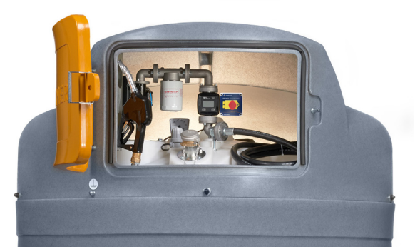
DISPENSING CABINET FOR 1,500, 2,500 AND 5,000 LITRE STORAGE TANKS

ALL APPROPRIATE CARE HAS BEEN TAKEN TO RECORD ACCURATE TECHNICAL DETAILS ABOVE - HOWEVER ALL WEIGHTS AND MEASUREMENTS SHOULD BE CONSIDERED APPROXIMATE