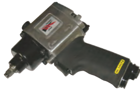
Order Code: TH-W11