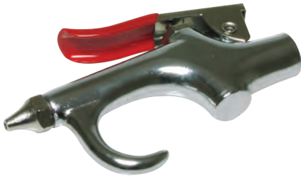
1/4" BSP Palm Blow Gun