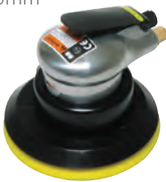
Order Code: SP-905