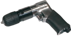
Order Code: SP-D135KL