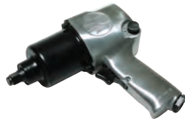
Order Code: TH-W12