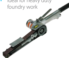
Order Code: SP-944