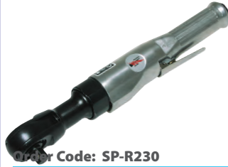
Order Code: SP-R230