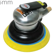
Order Code: SP-904