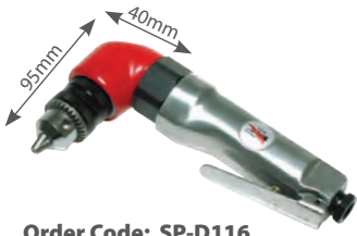
Order Code: SP-D116