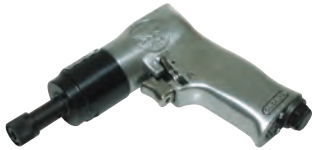
Order Code: SP-D131-DD