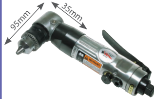
Order Code: SP-D117