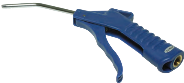
1/4" Blow Gun