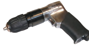
Order Code: SP-D136KL