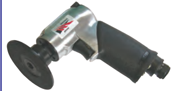
Order Code: SP-823A