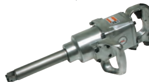
Order Code: TH-W18