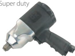
Order Code: AR-2025PT