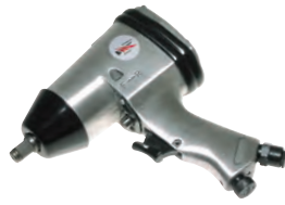
Order Code: SP-W15