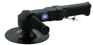
Order Code: SP-921