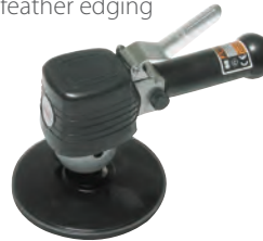
Order Code: SP-903