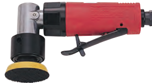
Order Code: SP-900C