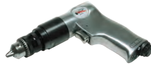
Order Code: SP-D136