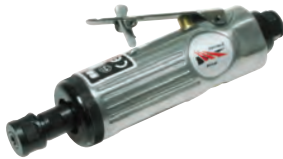
Order Code: SP-G700A