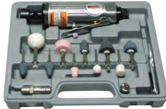
Order Code: SP-G703