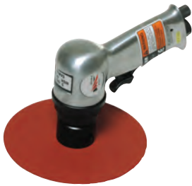
Order Code: SP-913