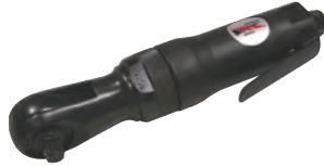
Order Code: SP-2403