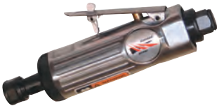
Order Code: SP-G706A