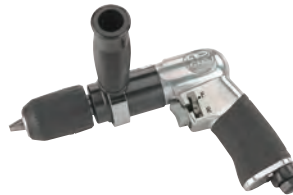
Order Code: AR-1513B