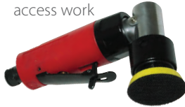
Order Code: SP-900A