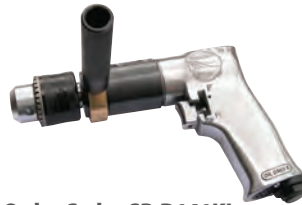
Order Code: SP-D141KL