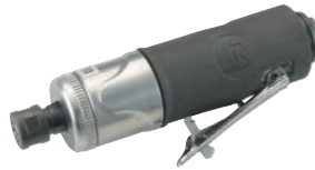
Order Code: AR-1503B