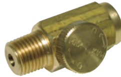
1/4" BSP In Line Regulator