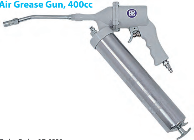
Air Grease Gun, 400cc