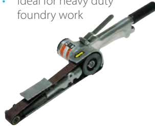
Order Code: SP-942