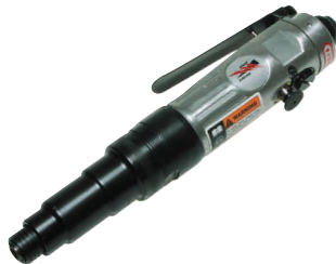
Order Code: SP-S826