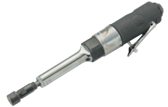
Order Code: AR-1504-B