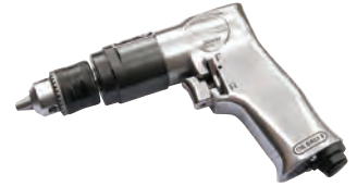
Order Code: SP-D135