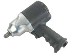
Order Code: AR-2015PT