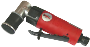
Order Code: SP-900B