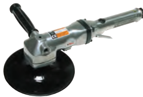
Order Code: SP-918