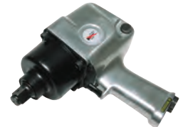
Order Code: TH-W16