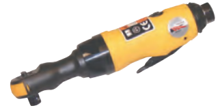
Order Code: SP-2302