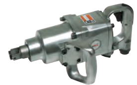
Order Code: TH-W18S