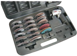
Order Code: SP-823AK