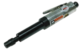
Order Code: SP-G709