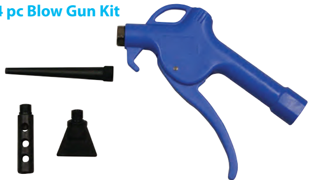
4 pc Blow Gun Kit