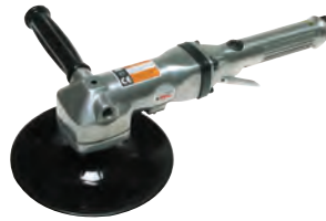
Order Code: SP-922