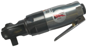
Order Code: CA-2402