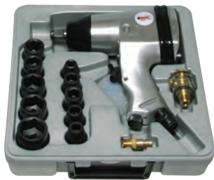
Order Code: SP-W15K