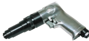
Order Code: SP-S805