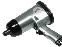
Order Code: SP-W25