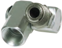
3/8" BSP Swivel