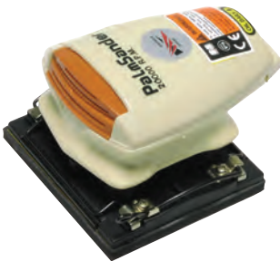
Order Code: SP-926