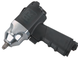
Order Code: AR2005PT