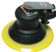
Order Code: TS-880