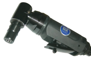
Order Code: AR-4527