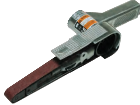
Order Code: SP-937