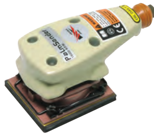
Order Code: SP-929