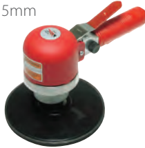
Order Code: SP-901