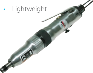
Order Code: SP-S829