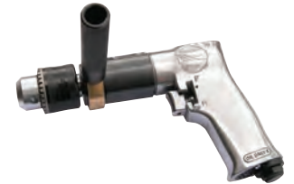
Order Code: SP-D141