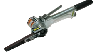
Order Code: SP-941