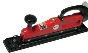
Order Code: SP-935