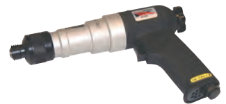
Order Code: SP-S808A