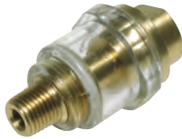
1/4" BSP In Line Oiler