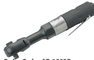
Order Code: AR-1502B