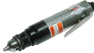
Order Code: SP-D122