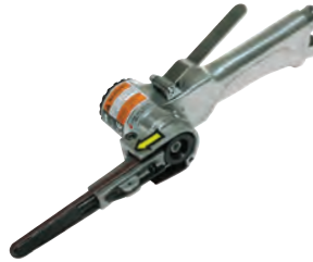
Order Code: SP-938