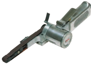
Order Code: SP-936