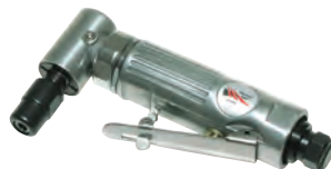
Order Code: SP-G707A