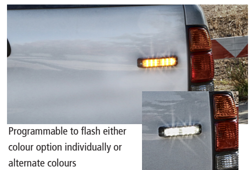
Programmable to flash either colour option individually or alternate colours