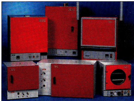
The 'EASY HEAT' oven is just part of the Townson + Mercer range of quality products.

With such a wide range you might need some help choosing the best option for your application. The following information will explain the benefits of some of the options available, if required our engineers can help with the final decision.