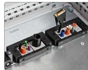
KDR 2 | KDR-ESR

Flanged plates for enclosure walls and module plates for enclosure bases for mounting of cable entry frames.