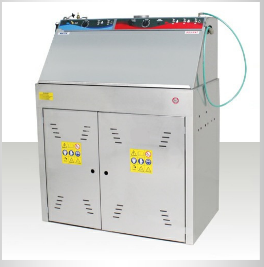
High quality equipment for your paint facility, accept nothing less

Dual Spray Gun Washers for Solvent and Waterborne Paints