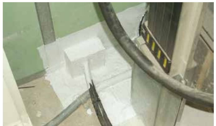
Riser cupboard with fire integrity reinstated.