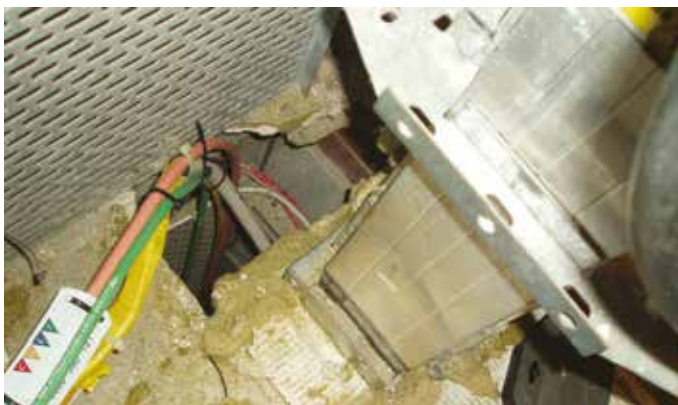
Damaged fire barrier in riser cupboard compromises the building's fire safety.