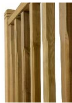
Stop Chamfered Spindles