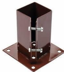
Bolt Down Post Anchor