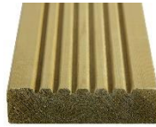
Premium Decking Board