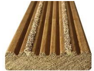
Enhanced Grip Deck Board