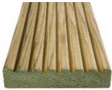
Standard Decking Board