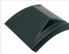
REN018 FRONT & REAR MUDGUARD - LH & RH