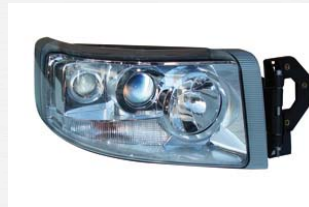
REN059 HEADLIGHT - RH *W/O FOG LAMP REN061 HEADLIGHT - RH *C/W FOG LAMP