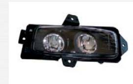
RENO32 SPOT & FOG - LH