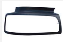
REN006 HEADLIGHT BEZEL - RH