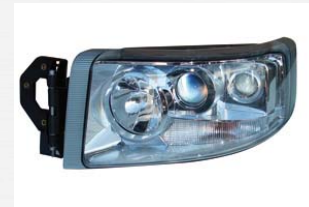
REN060 HEADLIGHT - LH *W/O FOG LAMP REN062 HEADLIGHT - LH *C/W FOG LAMP