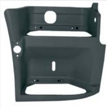
REN047 FOOTSTEP – RH