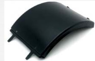
REN016 REAR TOP WING - RH & LH *1ST SERIES STANDARD HIGHT