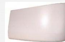
REN039 BUMPER CORNER - LH