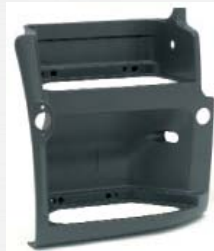
REN010 FOOTSTEP – RH