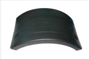
RENO55 REAR TOP WING - RH & LH