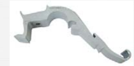
RENO52 WING STRAP BRACKET