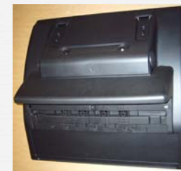
REN020 REAR OF REAR MUDGUARD - LH & RH