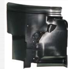
REN009 FOOTSTEP PROTECION – LH