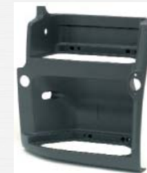
REN011 FOOTSTEP – LH