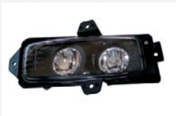
RENO31 SPOT & FOG - RH