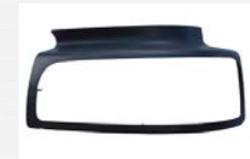
REN007 HEADLIGHT BEZEL - LH