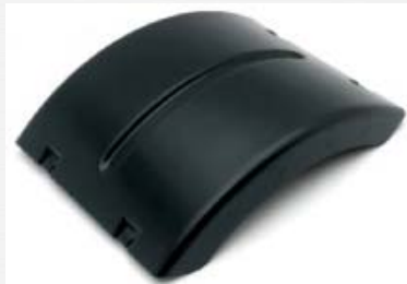
REN014 REAR TOP WING - RH & LH *1ST SERIES STANDARD HIGHT