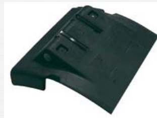
RENO53 REAR MUDGUARD - LH