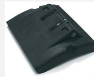
RENO49 FRONT & REAR OF REAR MUDGUARD - LH & RH