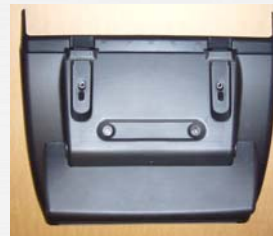
REN019 FRONT OF REAR MUDGUARD - LH & RH