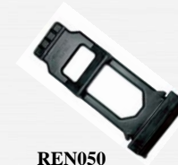
RENO50 NEW SHORTER FASTENING STRAP