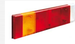
RENO36 LEN - LH & RH