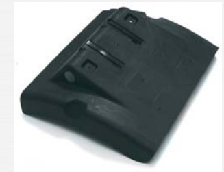
RENO49 FRONT & REAR OF REAR MUDGUARD - LH & RH