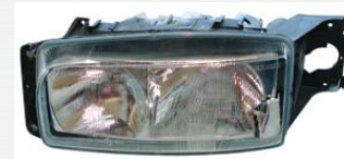
RENO28 HEADLIGHT- LH