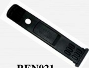
REN021 STRAP TO SUIT: (REN014 & 015)