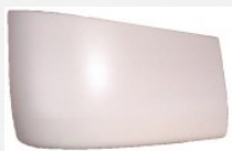
REN038 BUMPER CORNER - RH