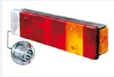
RENO34 REAR LAMP - RH