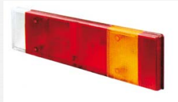
RENO36 LEN - RH & LH