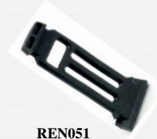
RENO51 FASTENING STRAP