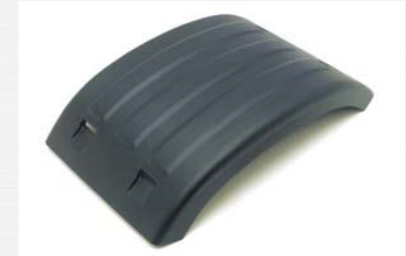
RENO48 REAR TOP WING - RH & LH