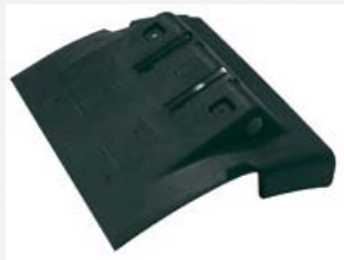
RENO54 REAR MUDGUARD - RH