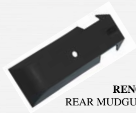
RENO56 REAR MUDGUARD COVER