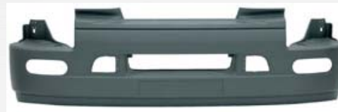
REN002 BUMPER *WITH FOG LAMP HOLES