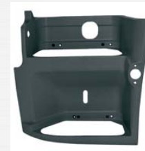
REN048 FOOTSTEP – LH