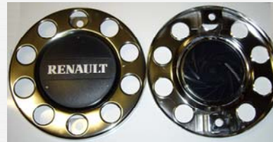
RENO23 WHEEL HUB COVER