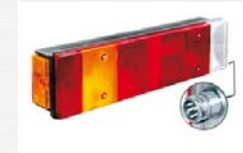
RENO35 REAR LAMP - LH