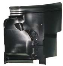
REN008 FOOTSTEP PROTECION – RH