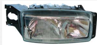
RENO27 HEADLIGHT- RH