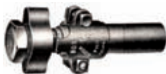
Original "Boss" Coupling, patented 1917