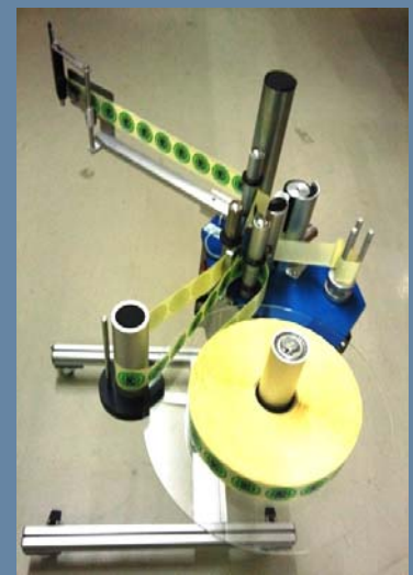
Ecoline 100 LH with extended snorkel applicator option