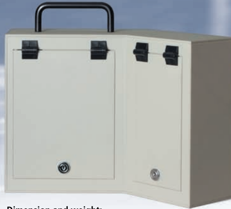
Dimension and weight: 37 x 26 x 23 cm (W x H x D), approx. 3 Kg