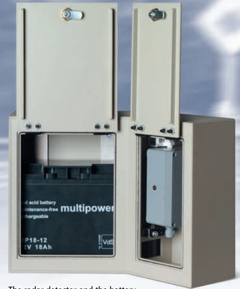
The radar detector and the battery are behind the front lids.