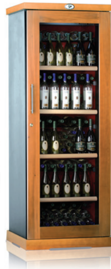
CEX801 Wood model with glass door & multi temperature.