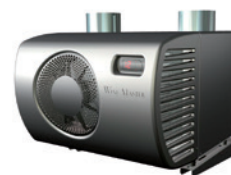
Wine IN 25