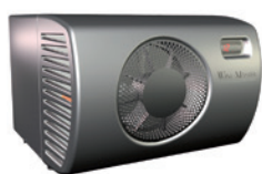
Wine C25, C25S, C25SR