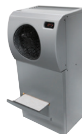
Wine IN 50+