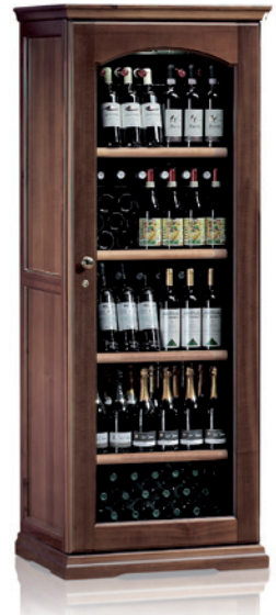
CEX501 Wood model with glass door.