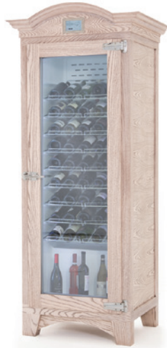
Classic Line Natural wood cabinet with vintage handle, lock and external hinges