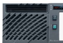
Wine C50S, C50SR