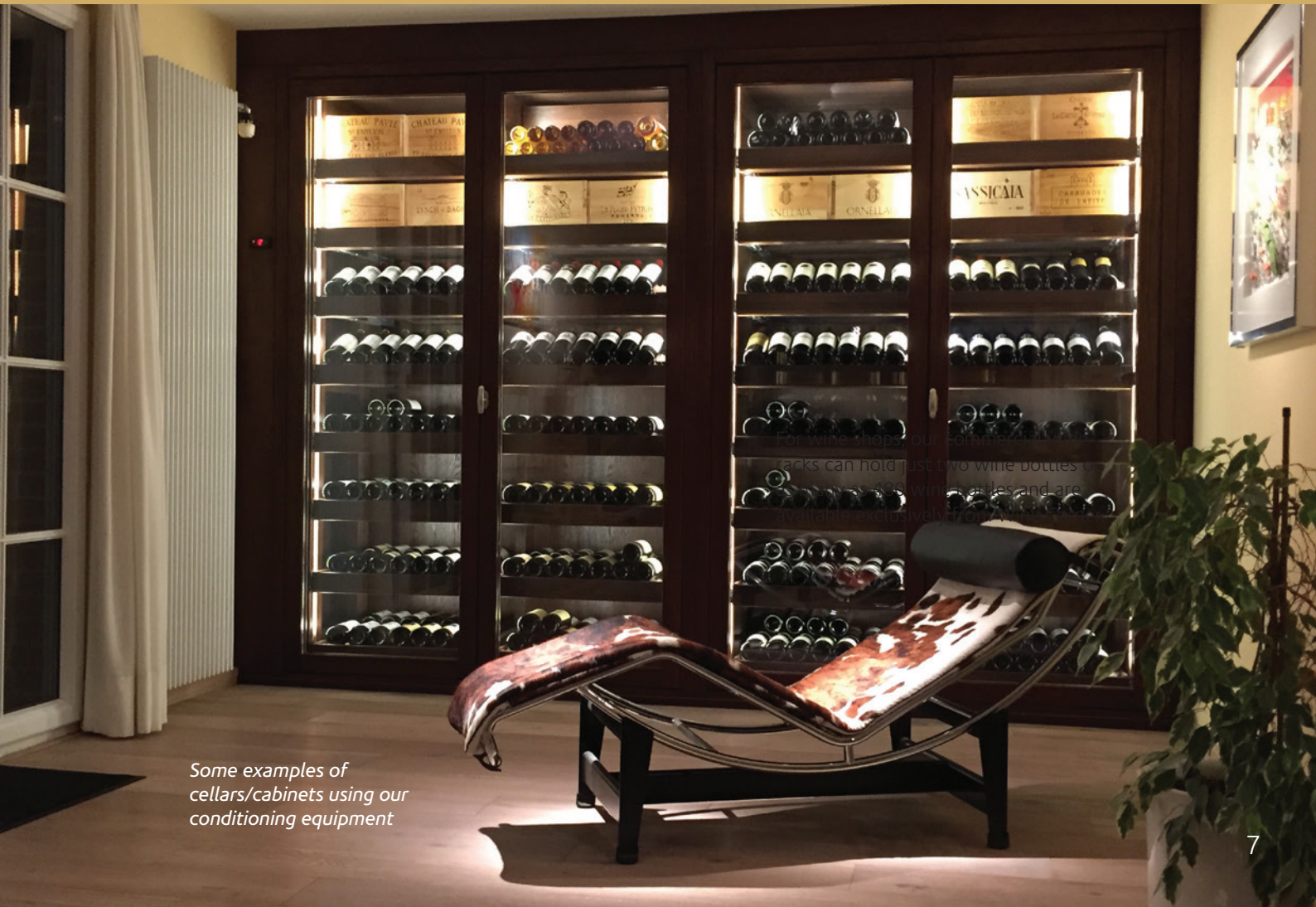
Some examples of cellars/cabinets using our conditioning equipment

This custom built service means you'll get your own unique wine cabinet or wine cellar, fitting perfectly and complementing or contrasting with your other furniture. For more details, please call 01302 744916 or 03333 702589.