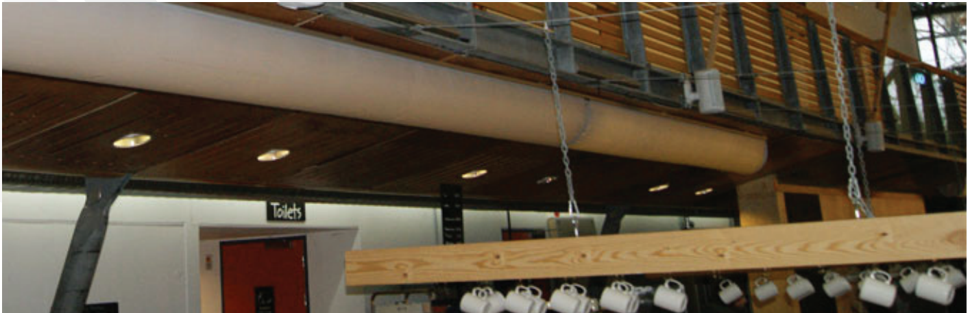
Kitchen Area with LED Lighting INSIDE the Fabric Duct