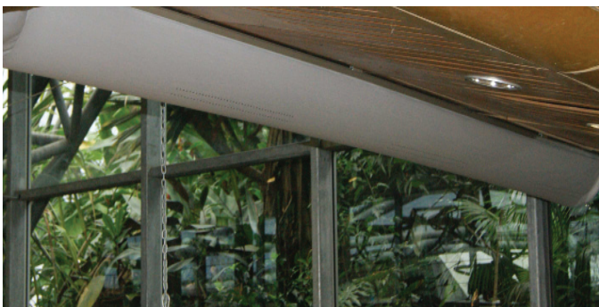
The restaurant links two different BIO DOMES