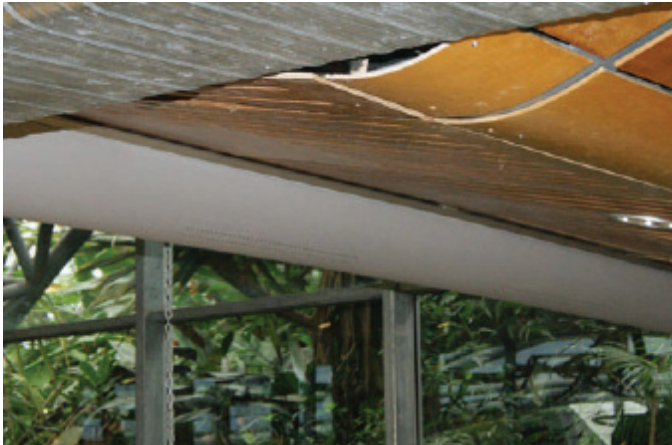
Flat Oval rigid duct converts to Fabric Half Round

The restaurant called for two distinct air patterns from each duct. From the front of each Fabric Duct the air exited large diameter laser cut perforations to jet into the seating area, whilst inducing large volumes of ambient air to mix and slow the velocity once in the occupied zone. From the back of the duct a similar approach would have been too draughty for serving staff. Here we used blocks of 0.4mm microperforations allowing large volumes of air to exit very small diameter laser cut perforations, the air focussed into a specified direction, providing a high air volume but at an incredibly low velocity - providing cool, fresh air right into the serving environment.