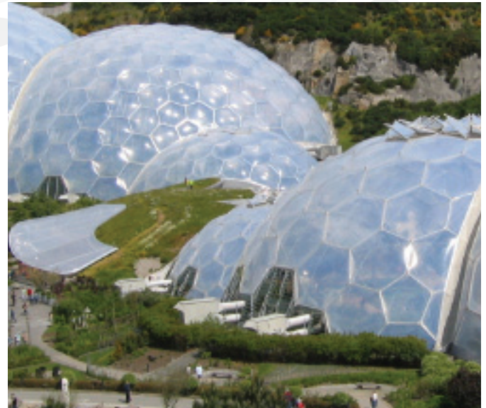
Eden Project - Cornwall UK

Of specific interest on the project was the Cleanroom nature of the materials supplied by Prihoda, designed to achieve ISO4 international standard, and specifically guaranteed not to shed any fibrous materials into the air stream.