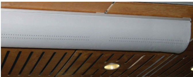
Laser cut Perforations directed towards seating areas