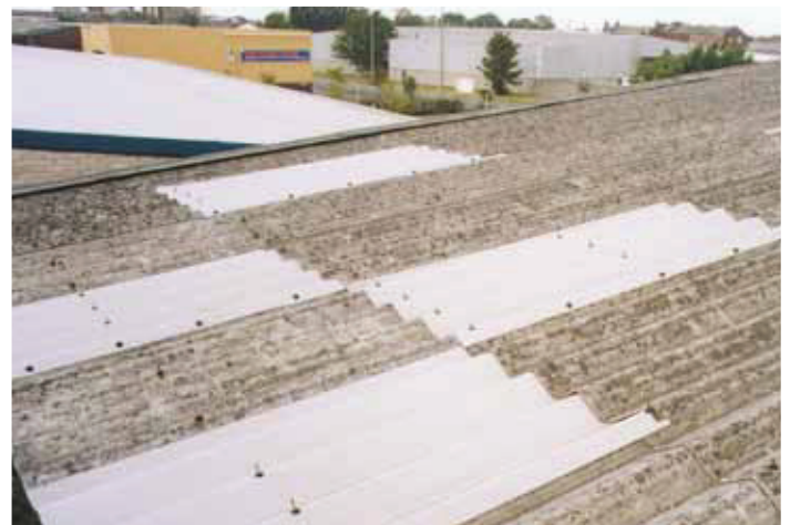
Top left: Fixsafe system Bottom left: Citadel sheets Top right: Monarch F rooflights Bottom right: DR-Refurb sheets