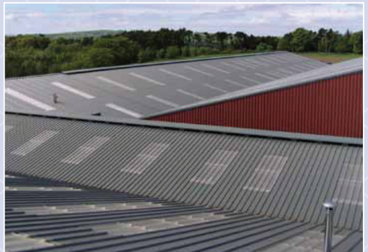
Above: Supasafe triple reinforced rooflights Top right: Single skin rooflights Bottom right: Factory Assembled Insulating Rooflights