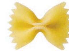
8 PASTA AND RICE