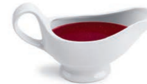
9 SOUPS, GRAVY AND BOUILLONS