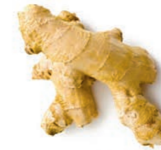
5 FINE HERBS AND SPICES