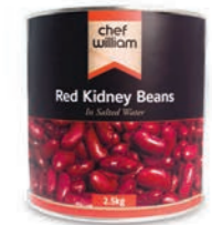
11 CANNED VEGETABLES