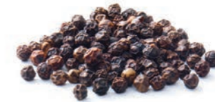
6 SEASONINGS AND PEPPER