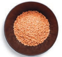
7 SEEDS AND PULSES