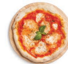
10 SAVOURY MIXES