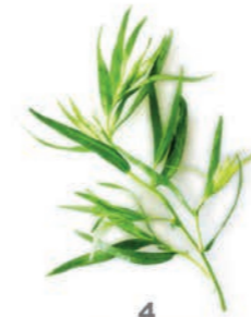
4 FINE HERBS AND SPICES