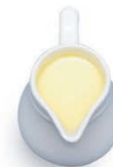
12 BAKING RANGE