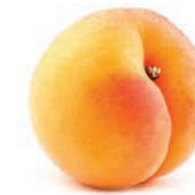
14 DRIED FRUIT