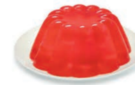
13 DESSERT RANGE