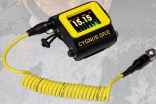
DIVE (Underwater A-Scan)