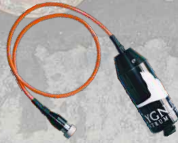
Mini ROV Mountable