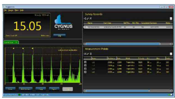
CygLink Software Screenshot

CygLink is a Windows® application which is used to transfer information from the Cygnus 2+ thickness gauge to a computer. The information can then be used as a PDF report or CSV file which can be analysed, stored and exported.