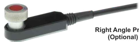
Right Angle Probe (Optional)

With multiple echo, readings are taken by measuring the time delay between any three consecutive backwall echos. The time of T1 (coating thickness) is ignored. The times of T2 and T3 are equal to the time that it takes to travel through the metal. Only by looking at three echos can the measurements be automatically verified (where T2 = T3).