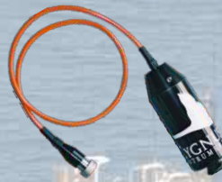
Mini ROV Mountable