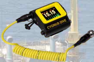
DIVE (Underwater A-Scan)