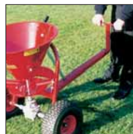
Manual Handle (REF: HBS)

The broadcaster spreaders have wide profile wheels for superior grip to drive the all metal gearbox, which in turn drives the spreading disc. The spreaders may be used, when fitted with the guard (Ref: BSG), to spread dry salt, sand and grass seed. The spread width (2-6 metres) is determined by the forward speed of your towing vehicle (max 10mph). An adjuster lever is set to meter the correct amount of product to be broadcast.