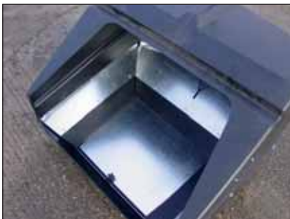
Cover plate in position