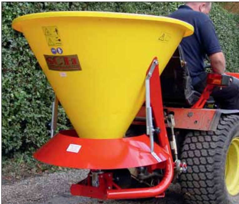
This shows the unit fitted with an optional deflector guard

The broadcaster is fully mounted on a category I three point linkage with a capacity of 200+ litres. The broadcaster is capable of full width spreading or may be used with right or left shut off. The conical shaped hopper allows the material to free flow onto the spinning disc. A fixed agitator is incorporated. P.T.O. shaft is supplied with the unit.