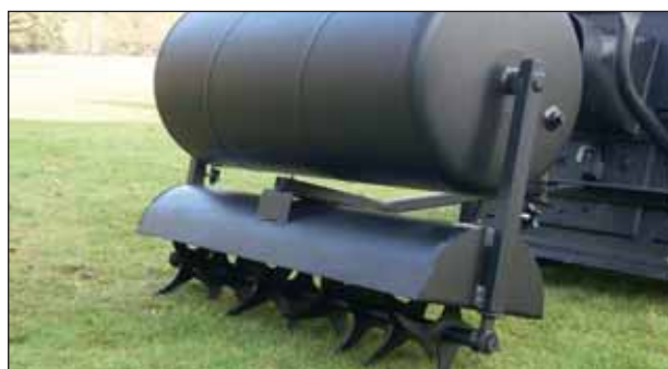
Aerator at work