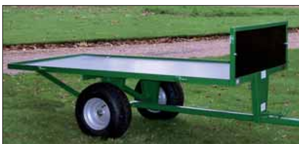
As Flatbed with sides removed (green chassis optional)