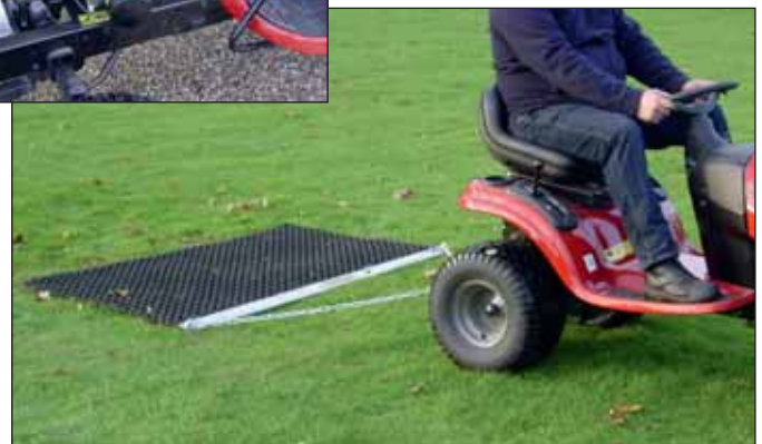
With rubber drag mat