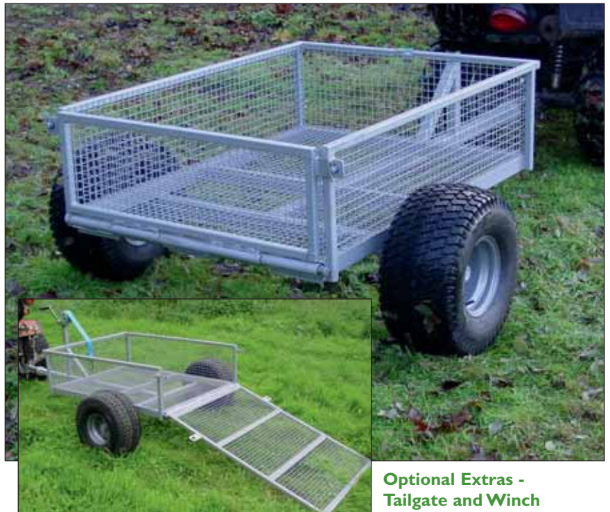
Optional Extras - Tailgate and Winch