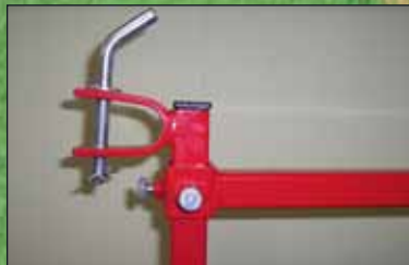
Adjustable Clevis Hitch