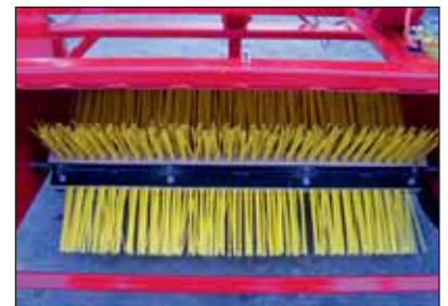
Strong adjustable brushes