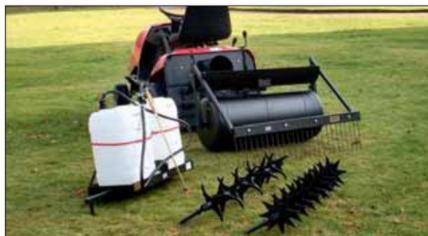
Complete Budget Range