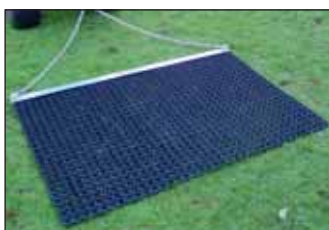
Rubber Drag Mat