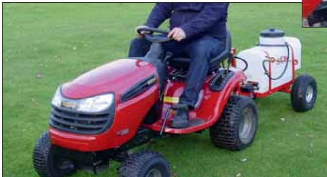
With 70 litre sprayer