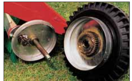
Strong metal gears