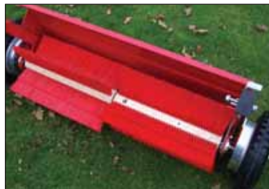
The heavy duty brushes