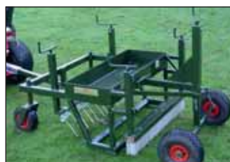
Deep Grooming Unit