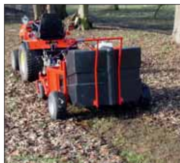
The Unit doubles up as an excellent general purpose collector