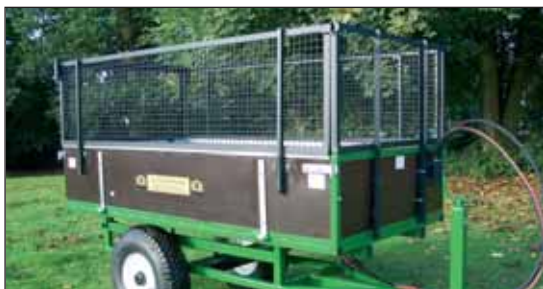
With extension sides