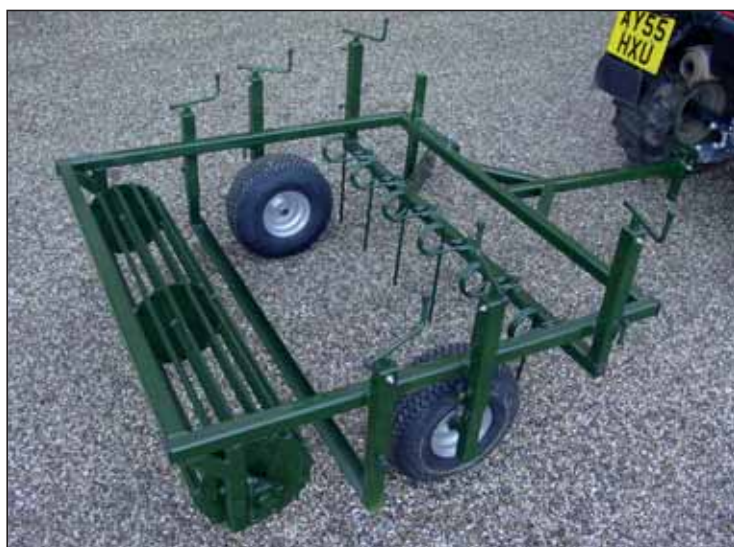
With tow bar