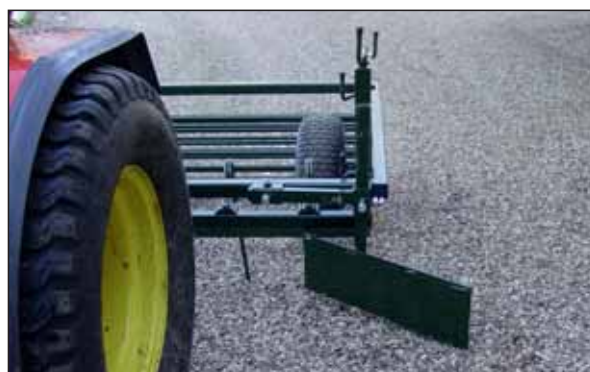
Side scraper bar