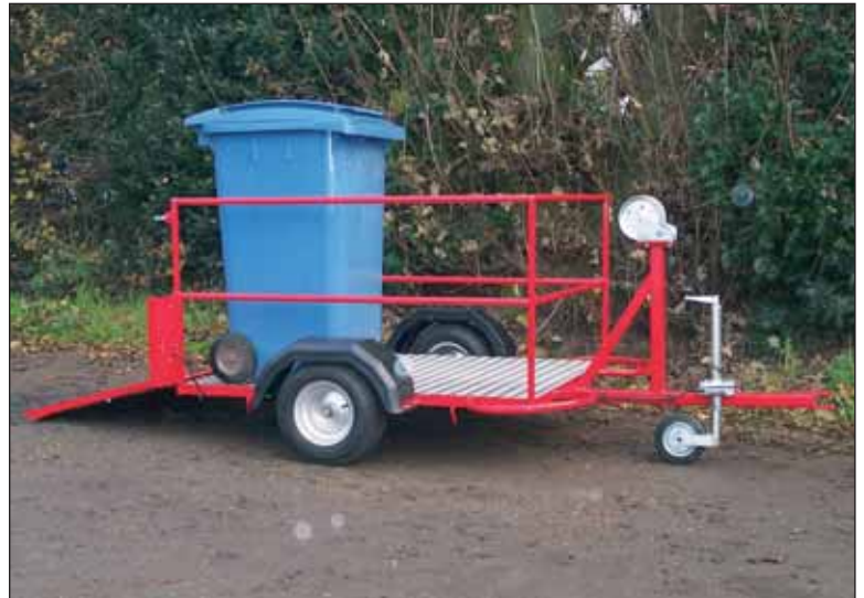
Shown with optional jockey wheel and winch