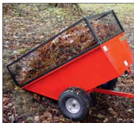
With extension sides (REF: GDTX)