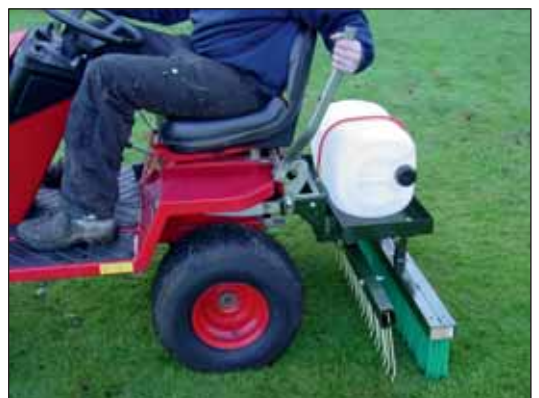
Lift Handle and Water Try

The towing tractor is a Countax or Westwood, which can be your choice between a new unit or an AI pre owned unit. The rear lift is incorporated design of the system to allow the tools to be lifted out of work when required.