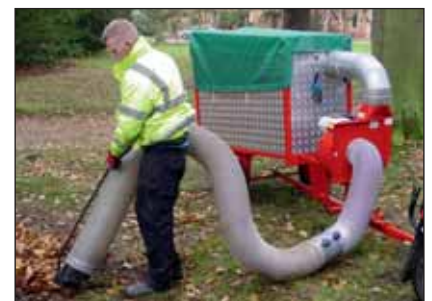
Optional wander hose kit