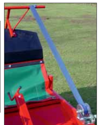
Winch fitted as standard