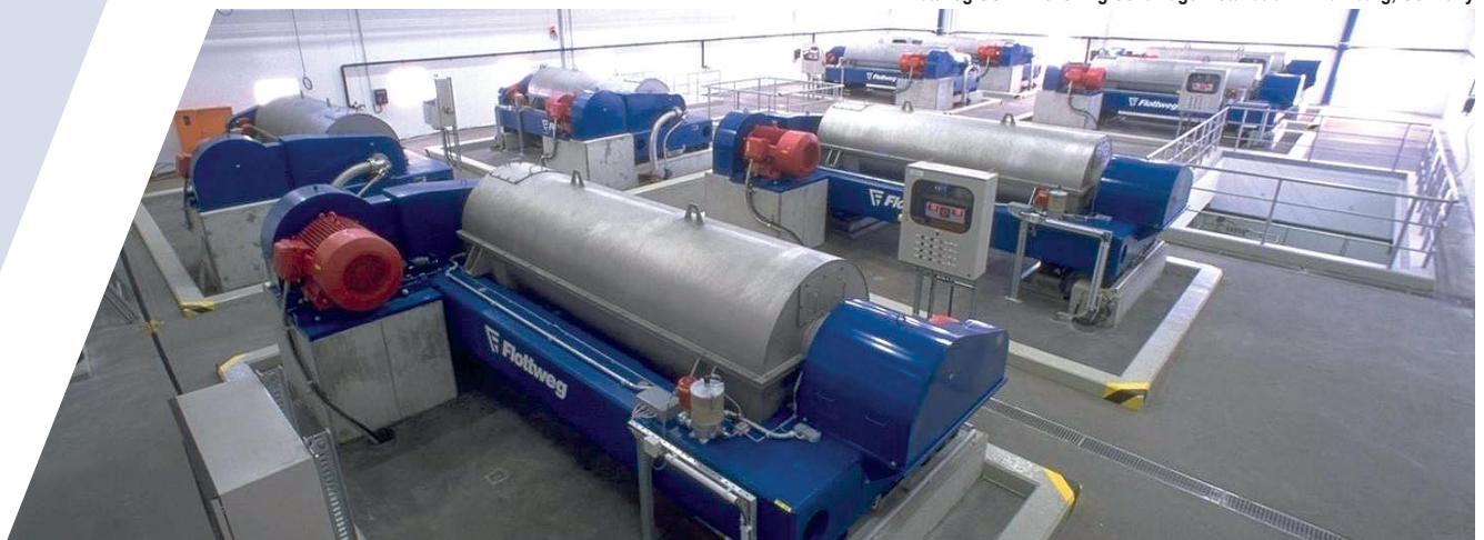
Flottweg OSE Thickening Centrifuge Installation in Hamburg, Germany

The Flottweg OSE Decanter supports optimum digestion and gas yield while simultaneously using as little space as possible and reducing operating costs. In comparison with other means of thickening sludge, there is no system with comparable advantages!