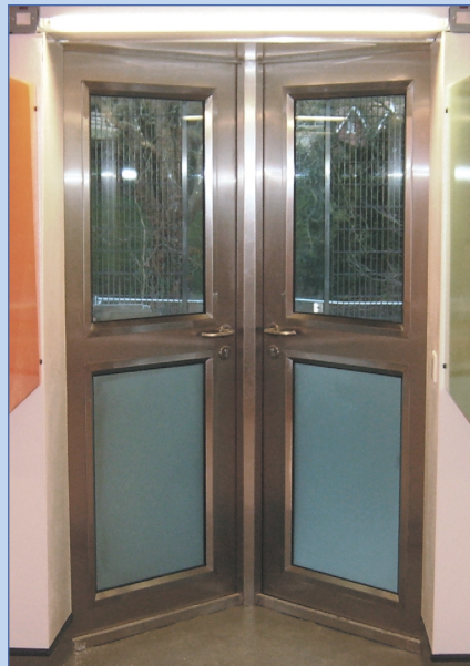
CLINICAL STAINLESS STEEL