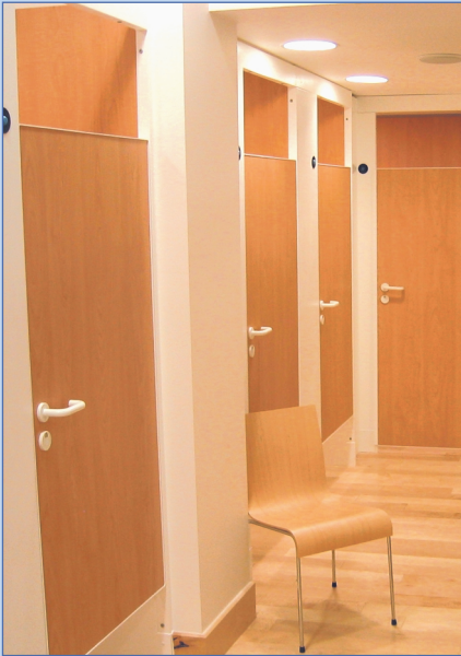
GAP FITTING ROOM

stylish and affordable - call 01487 840885