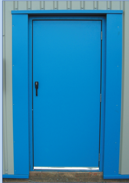
INDUSTRIAL & COMMERCIAL