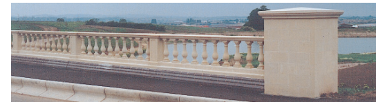
Reconstructed stone bridge parapets coated with Nu-Guard® Polymeric

Nu-Guard® AG finish is available in full gloss, satin or matt, and is U.V. resistant.