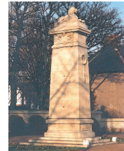
Stretford War Memorial Client: Trafford M.B.C.

The consistency of Nu-Cryl® AG allows excellent coverage rates, making it an extremely cost effective method of achieving long life protection.