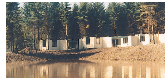
Center Parcs Longleat Main Contractor: TMS Joint Venture

This is a high performance product giving protection for a minimum of 10 years conforming to BS 5493 the code of practice for the protective coating of iron and steel against corrosion.