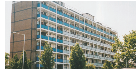
Comyns Close, East Ham London Borough of Newham