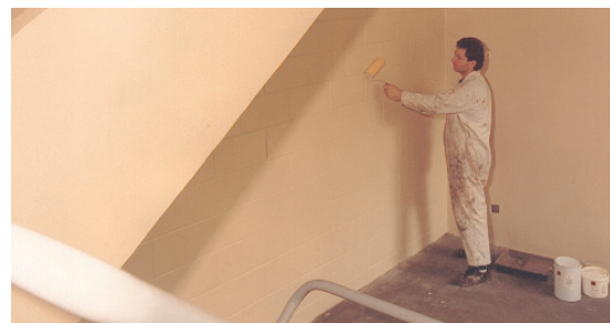
Communal Stairwells Woodhill Flats Client: London Borough of Camden

The consistency of Nu-Cryl®AG allows excellent coverage rates, making it an extremely cost effective method of achieving long life protection.