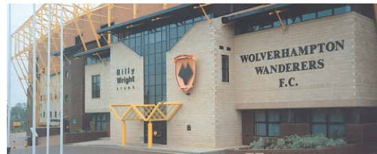
Molineux Stadium Client: Wolverhampton Wanderers F.C. Architect: Alan Cotterill Partnership

Nu-Guard®AG finish is available in full gloss, satin or matt, and is U.V. resistant.