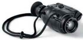
RECON M18 (640)