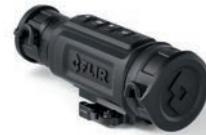
RS32 | 1.25-5X