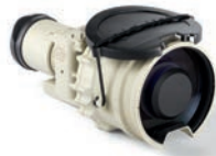
MILSIGHT S135 (MUNS)