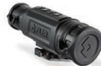
RS64 | 2-16X