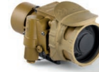
MILSIGHT T90 (TaNS)