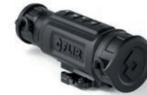
RS32 | 2.25-9X