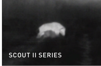
SCOUT II SERIES