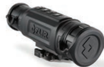
RS64 | 1.1-9X