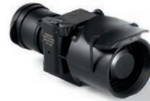
MILSIGHT T105 UNS