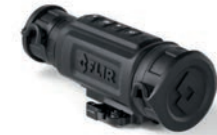
RS32 | 4-16X