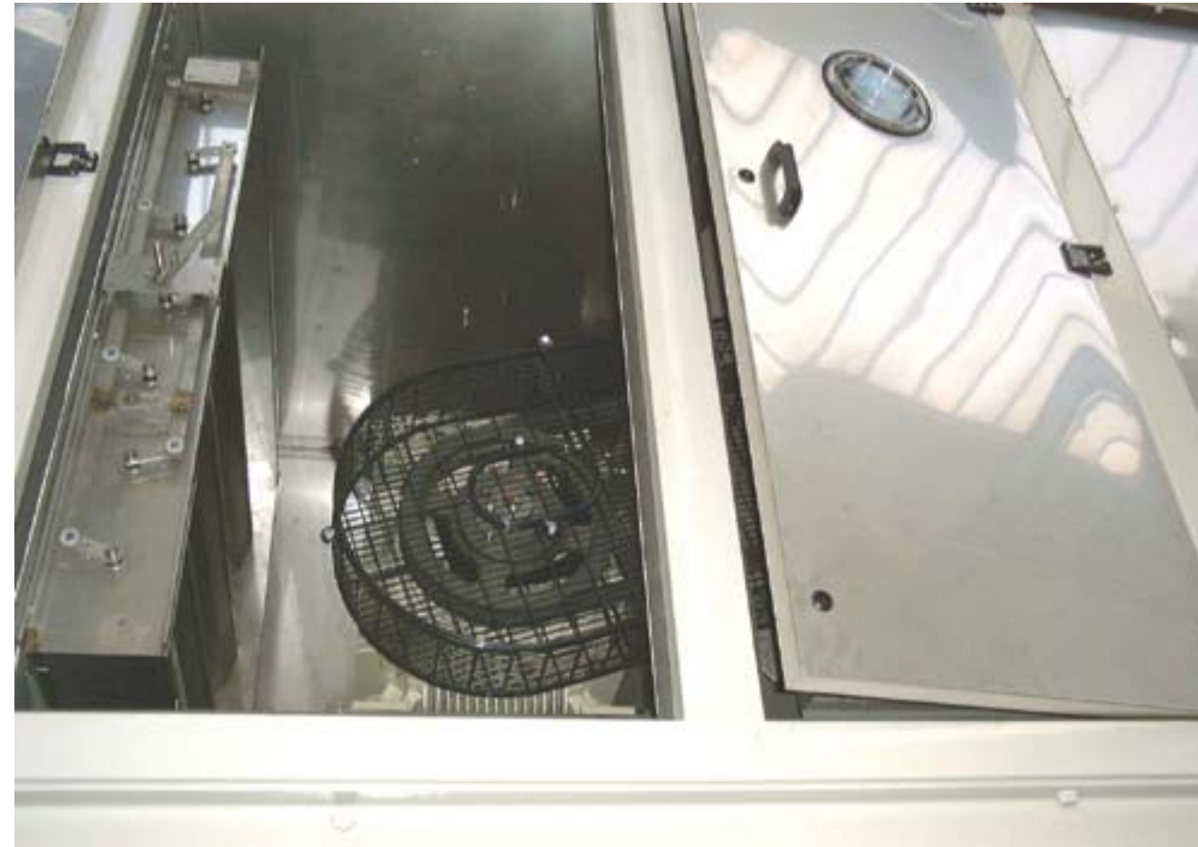
Specialist Air Handling Units in 316L Stainless Steel