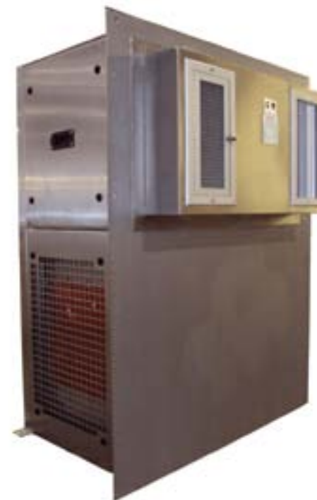
Packaged Air Conditioners