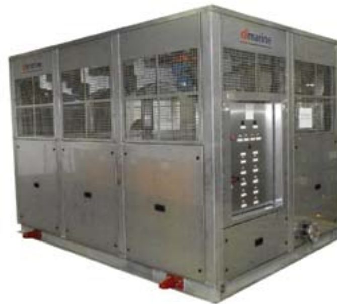
Air Cooled Water Chillers