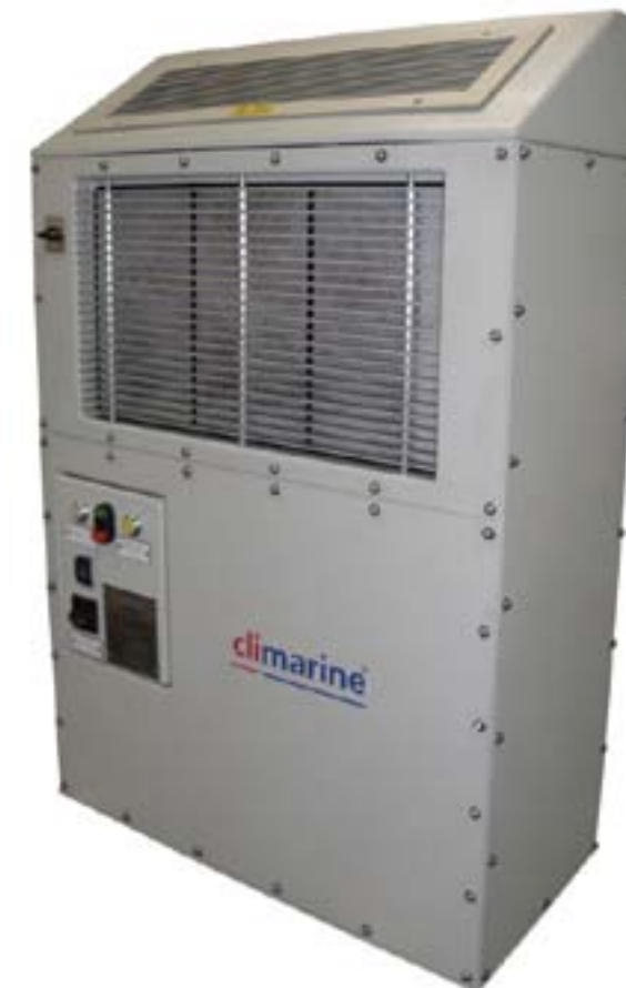
Water cooled Air conditioning units