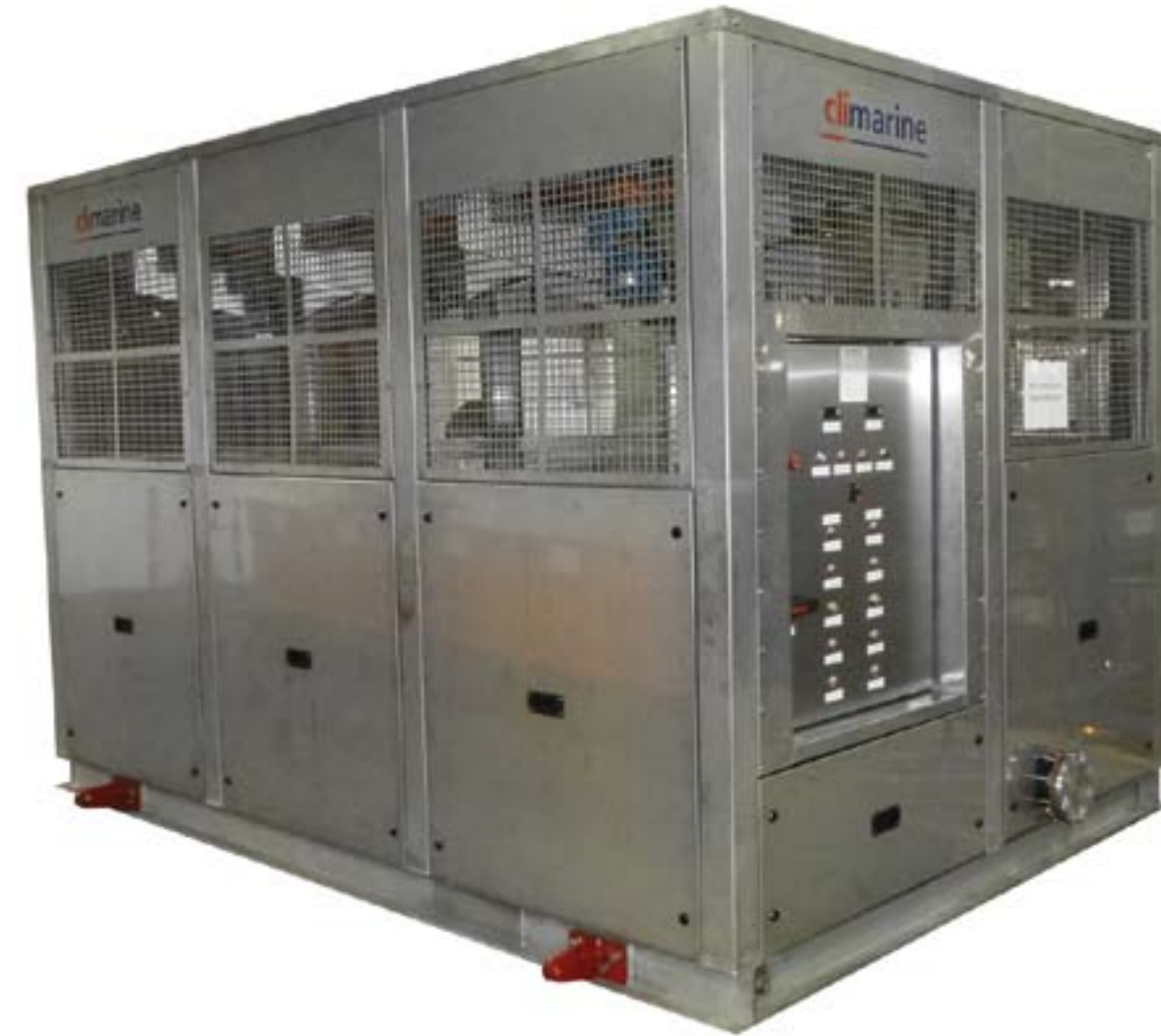
Air Cooled Water Chiller