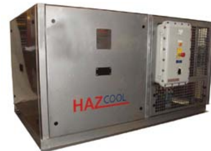
Rooftop Packaged Air Conditioning Unit