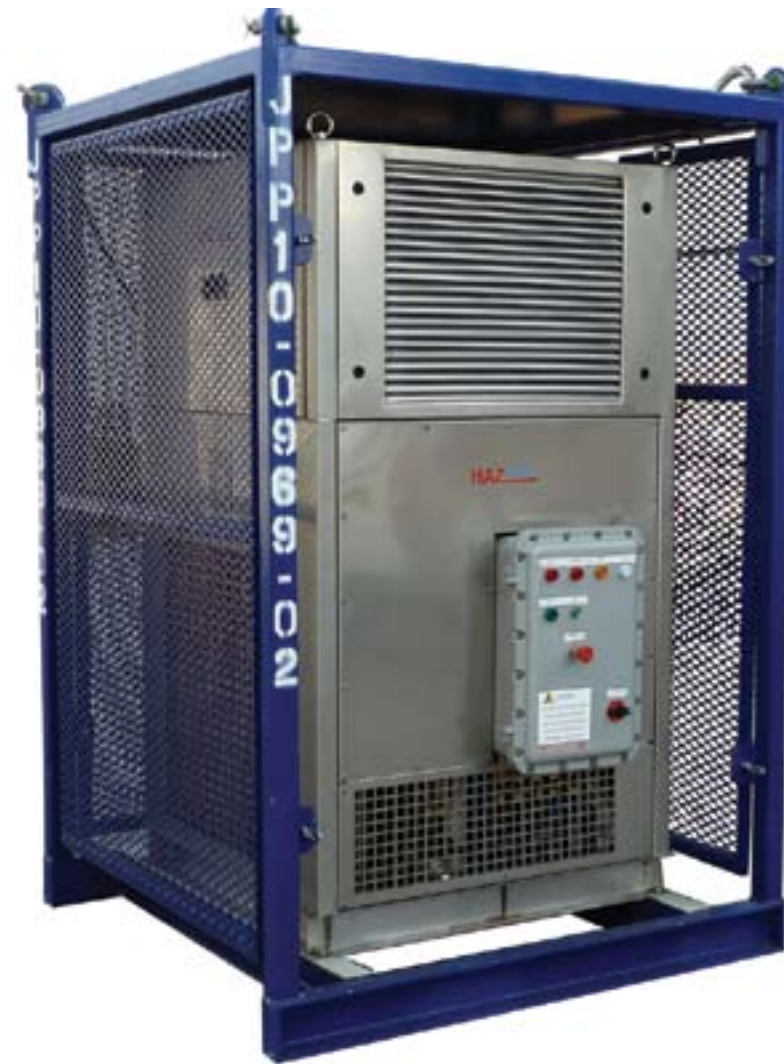
Packaged air conditioning units c/w DNV 2.7-1 lifting frame

Both our ranges include Water Chillers, Split or Packaged AC Systems, Refrigeration Systems, Condensing Units, Air Handling Units, Fan Skid Units and Control Panels.