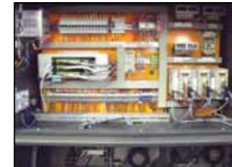
Examples of a servo upgrade to a high speed pillow pack machine