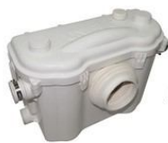
Information Sheet Uniflo Universal macerator