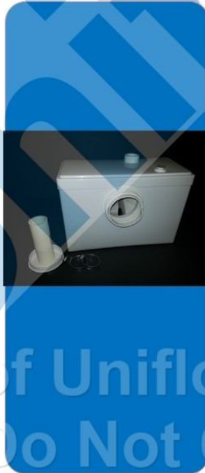
Uniflo Flush 1 Macerator Pump Dimensions