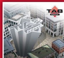
Structural & External Division