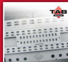
Sheet Metal Division