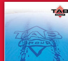
Swimming Pool Division