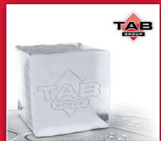
Air Conditioning & Ventilation Division