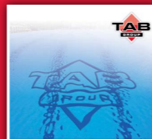
Swimming Pool Division