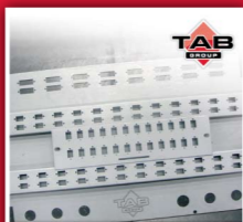
Sheet Metal Division