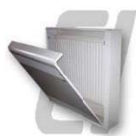
Steel Eazi-Access Radiator Covers