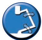
Articulated low boom models