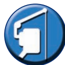
Jib & Winch models