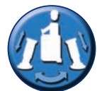
Street lighting pack

Offers the ability for the operator to walk in to the bucket, rather than climb in to the bucket. This is particularly beneficial for those operators frequently in and out of the bucket, day in and day out.