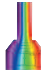
Thermal transfer through Liniar 'A Rated' outer frame