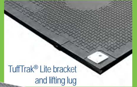
TuffTrak® Lite bracket and lifting lug

Material: High Density Polyethylene or Ultra High Molecular Weight Polyethylene Size: 3000mm x 2500mm x 32mm Weight: 185kg