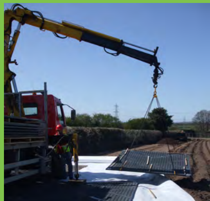
Depicts low profile traction surface