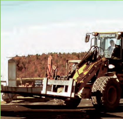
Depicts low profile traction surface