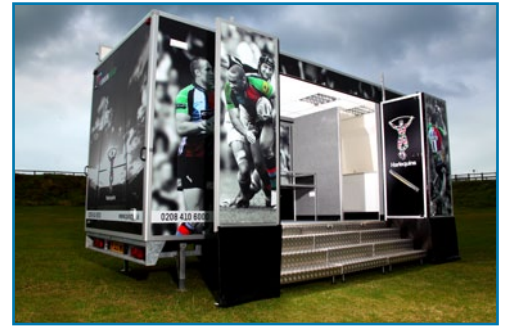
Set up in exhibition/hospitality mode