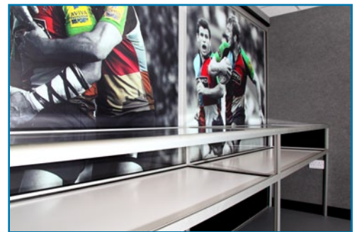
Internal shot showing serving counter with barn doors in closed position