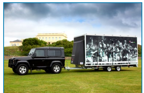
Hooked up and ready to roll