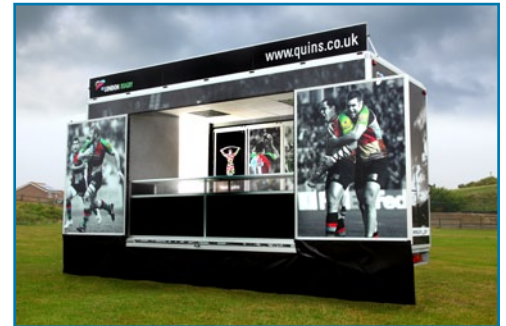
Set up in merchandising mode