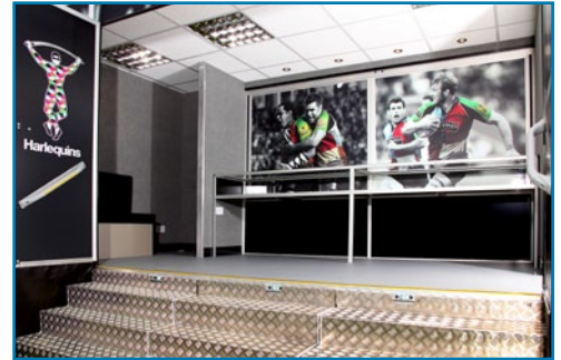
Full width aluminium steps leading to exhibition/hospitality area