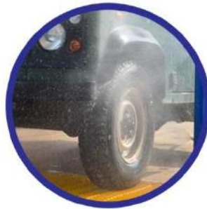
High quality pump for all round coverage