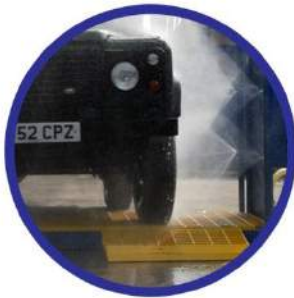
Targeted spray for maximum effectiveness