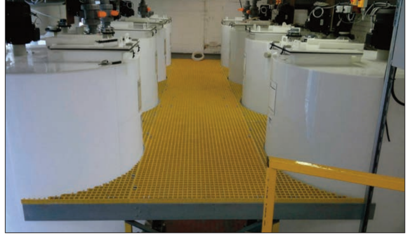
Tank Farm Platform