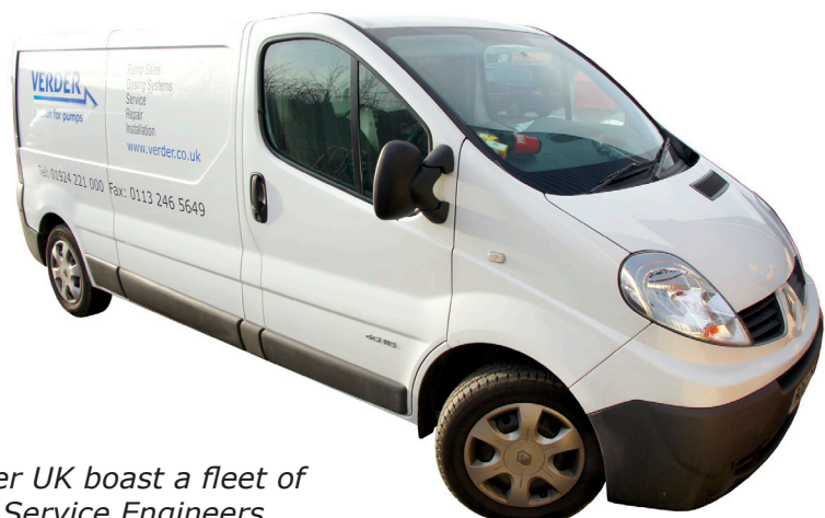
Verder UK boast a fleet of Field Service Engineers

Verder provides regular inspections on most installations and can tailor the service to meet your needs giving your plant a longer working life and can increase your return on investment rate. The Verder UK service team operates nationwide and can provide a wide range of servicing at your premises.