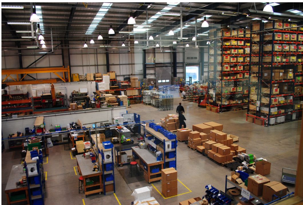
The Verder UK Service Centre and manufacturing facility

Verder can provide solutions to all of your service needs thanks to highly skilled and experienced engineers and state-of-the-art workshop facilities.