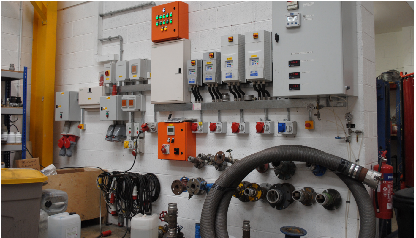
Part of the Verder test bed where extensive testing and data can be extracted