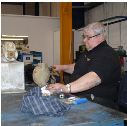
Above left: A Verder service engineer conducting maintenance on a Verderair pump. Above centre/right: Verder CAD design and finished dosing systems

Commissioning of your pumping system and control philosophy ensuring the correct application and that the specified duty of the unit installed satisfies all of its requirements. A pump can be retro-fitted in an existing system. We can audit your process and system for required duties and source fittings and accessories necessary for compatibility.