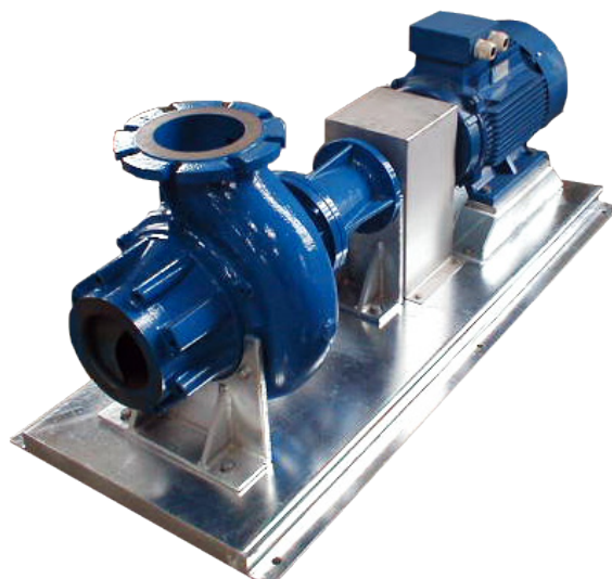
Below right: A Verderhus ready to be installed in a brewery, located in Denmark.

VERDER LTD. 3 California Drive Castleford WF10 5QH United Kingdom