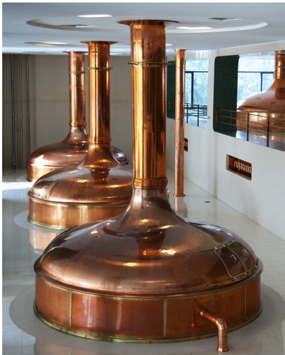
Copper mash tuns handling processing large quantities of mash

There were a number of potential solutions to this problem, including a simple gravity-operated pump coupled with an inlet valve – an option which was rejected due to the likelihood of blockages caused by the solids content – or a peristaltic pump which operated on the positive displacement principle. However, the large percentage of solids present in the malt mash could again lead to blockages here, caused by the rotor repeatedly opening and closing the flexible tubing used in this type of pump. Any blockage problems which resulted could have caused a recurrence of the drying out and thickening process, meaning that