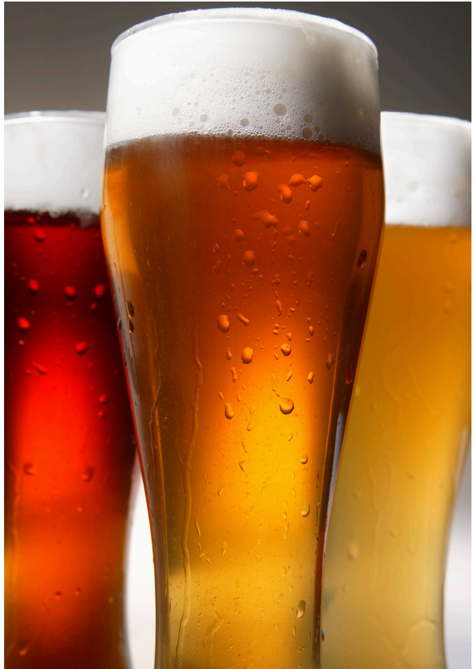
The brewmaster must be confident of his process equipment, particularly the pumping system. A blockage or failure could be extremely costly

For the malt mash application the HUS channel pump has performed flawlessly. During periods of downtime the pump has dramatically reduced the amount of moisture being lost from the malt