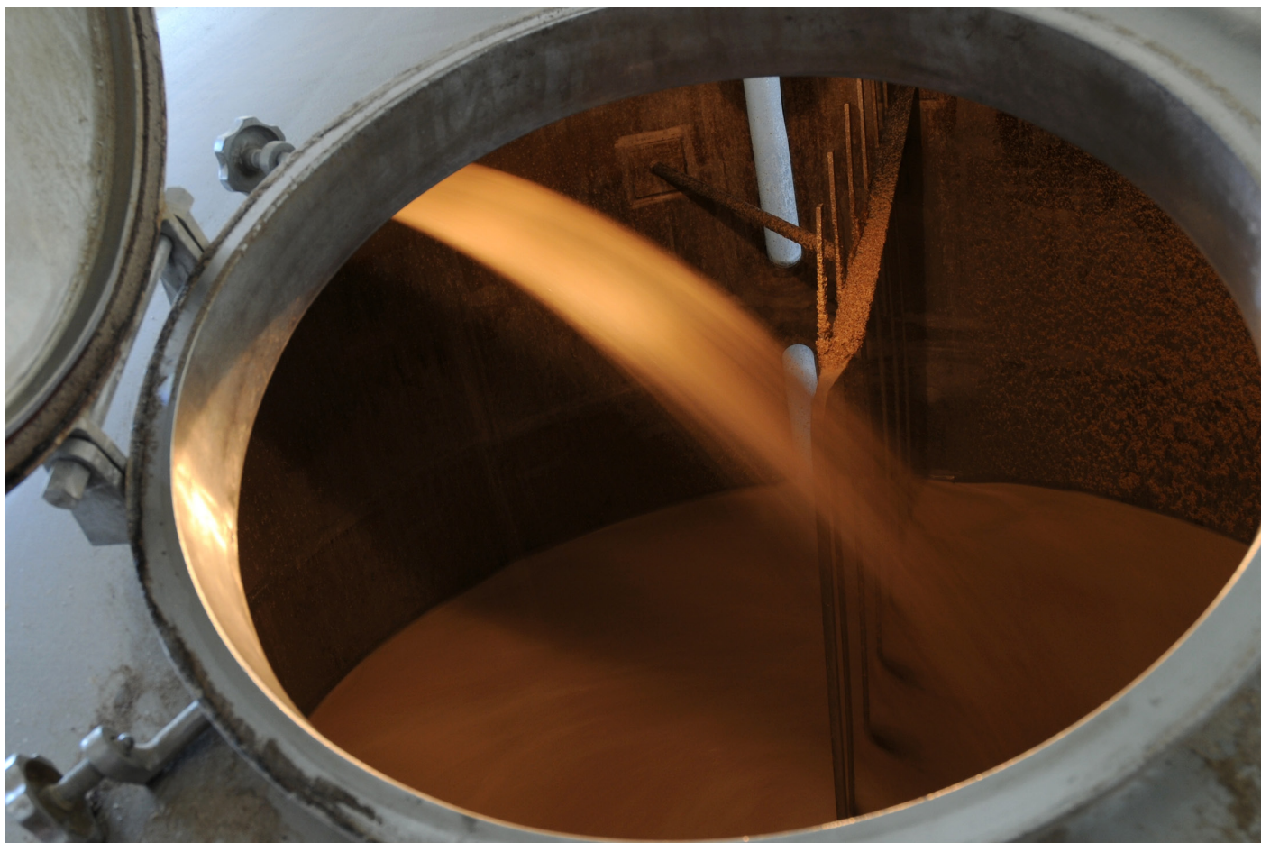
A mash tun with thick slurry, solid-laden malted barley and hops. The mash is wonderfully aromatic but difficult to transfer between vessels.